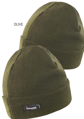
3M™ LABEL SEWN TO REAR